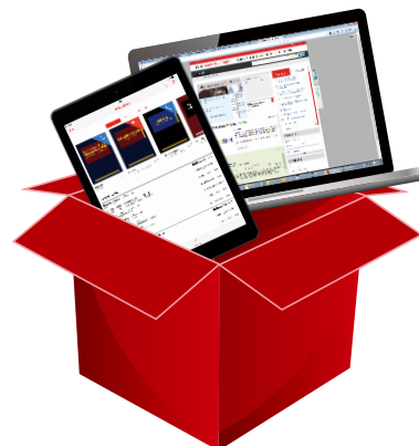
As part of a larger package of LexisNexis content

Please contact your Account Manager or speak to Customer Support on +852 2179 7888 for details.